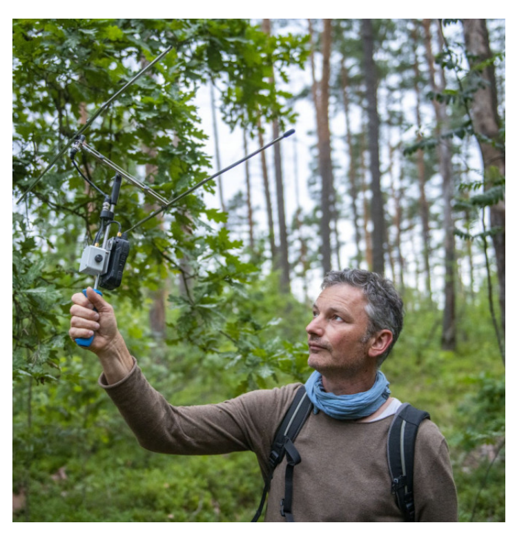
Field research of the project «Polesie - Wildlife» without Borders».

The scope of the project also involves plans of re-swamping more than six thousand hectares of previously drained land. Another key task of the project is to improve the management of designated natural conservation areas by reviewing the existing management plans and designing new ones, as well as tangible and intangible support of organisations managing these areas.