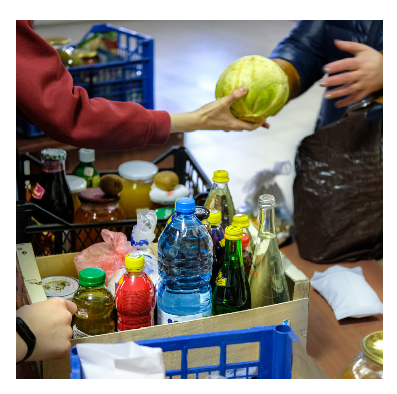
Food action action of the food bank «Pishcha», Minsk.

The Pischcha food bank initiative has been operating for several years in Belarus as a pilot at the premises of the Centre for Environmental Solutions. During this time, the project has been able to redistribute more than eight tons of foodstuffs among more than 1,000 needy families. The project operates solely in Minsk but can expand its operational area to other regions as well.