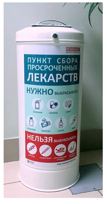
Container for waste collection of obsolete medicines, Minsk.

Naturally, the activity led to changes at the governmental level when in 2020 new Rules of Household Waste Treatment in Belarus were adopted to accommodate for the treatment of medical waste. The Minsk City Council of Deputies decided to set up a public system for the collection of expired medication from residents.