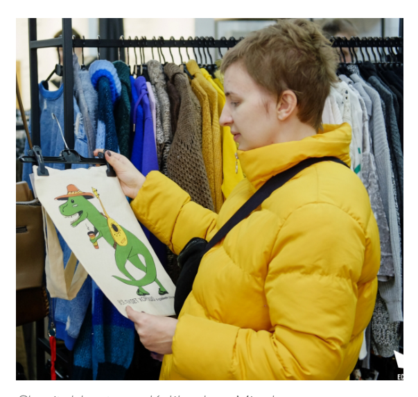
Charitable store «KaliLaska», Minsk.

The project is growing: now, in 2021, at KaliLaska they have an upcycling shop to make new products out of the old ones. For example, they repair fashion jewellery, make environmentally friendly bags and decorations from clippings, old postcards, etc.