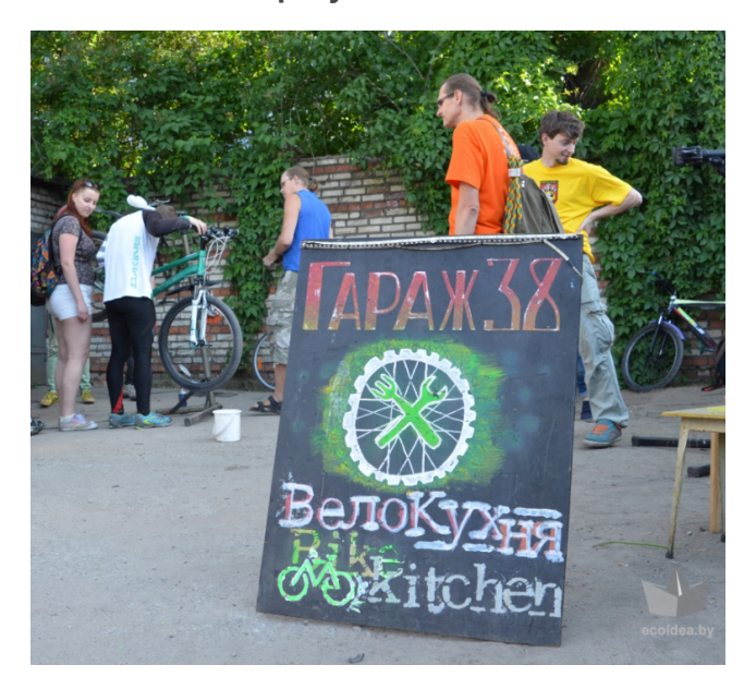
Community bike workshop «Garage 38»

It should also be noted that the integration of the principles of sustainable development into the activities of schools, NGOs, or other institutions promoting environmentally responsible lifestyles is very important for this target, i.e. it is essential to create role models and examples of how sustainable consumption and production can be integrated into the activities of an organization.