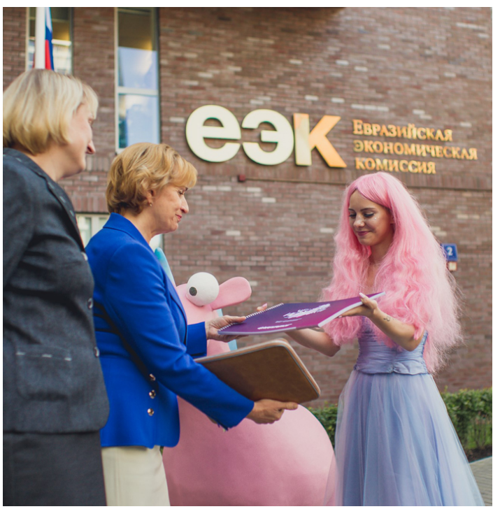
Transfer of proposals for phthalates to the EURASIAN ECONOMIC COMMISION, Moscow.

The manufacturers currently do not have to show the full composition of the material a toy is made of. There is no requirement to highlight substances dangerous for children's health either. The voluntary eco-labelling sometimes used by manufacturers does not always reflect the real situation.