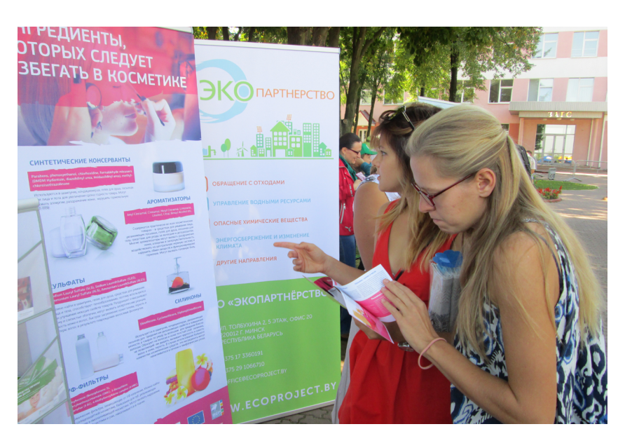
Street action «Think Before You Buy».

The Think Before You Buy campaign has a <u>website</u> of its own with materials about health and environmental risks related to the use of hazardous substances, information about potential hazardous chemical substances in various staple items and advice on how to look for safer alternatives and minimise the effects of hazardous chemical substances.