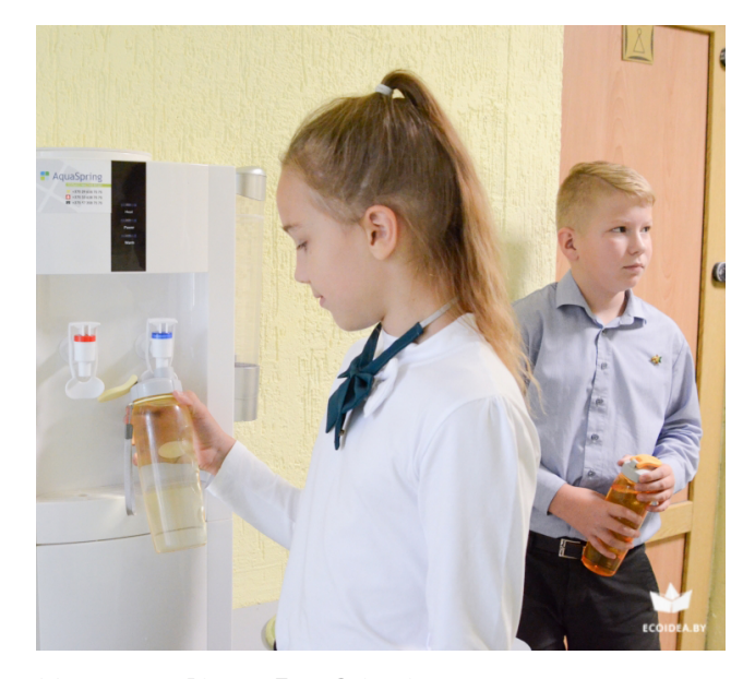
Movement «Plastic-Free Schools», initiated by Gymnasium No. 19 in Minsk

The Plastic-Free School initiative promotes environmental activities at educational institutions to encourage schools to refuse single-use plastics. By joining the initiative, schools demonstrate their commitment to initiate transformations by reorganizing their common practices. For example, schools can use ceramic mugs instead of plastic cups in classrooms and install a water filtering system to drink tap water instead of procuring bottled water, etc. Educational institutions can receive informational support upon their request, such as consultations by experts from the Centre for Environmental Solutions; assistance in conducting an initial audit on the use of disposable plastic at school; specific consultations on measures to be taken to reduce the use of plastic; conducting an educational lecture on the use of plastic at the school; educational materials for teachers and posters for interior decoration, etc.