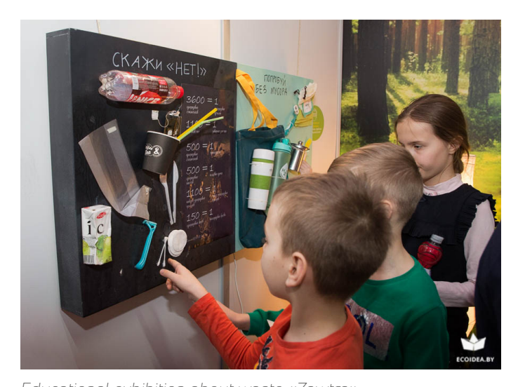
Educational exhibition about waste «Zawtra».